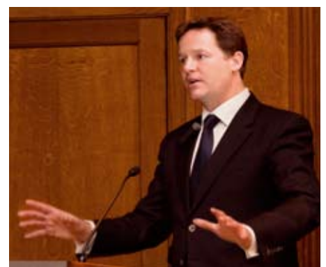
Above: Rt Hon Nick Clegg MP speaking at the FSLA dinner in aid of the SMF