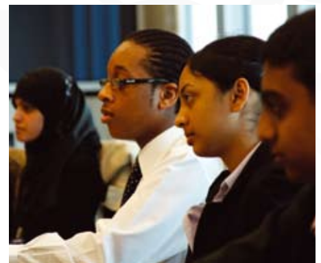
Above and below: Students discussing bank reforms with the Chairman of Barclays

We were very grateful to the FSLA for hosting the dinner, which raised £17,000 for the SMF and has led to further interest in its work from the legal and financial sectors.