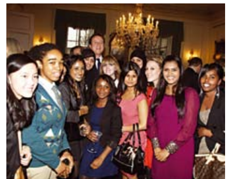
Above: APP participants with the Prime Minister David Cameron at No 10 Downing Street