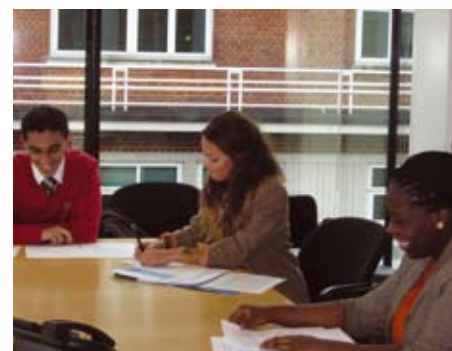
Above: Students on internship at Freshfields Bruckhaus Deringer

“Colleagues are always very impressed by the enthusiasm and attitude of the SMF students and there is always huge appetite to host the placements.” —Barclays