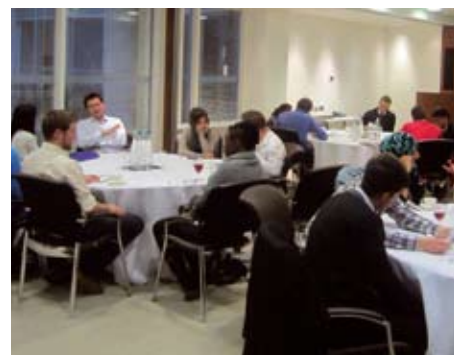
Above and below: Mentors helping their mentees with their university personal statements at 2011's September Mentor-Mentee Meet-up, hosted by Baker & McKenzie