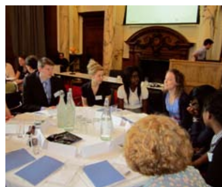
Above: Whitehall Programme participants at the Treasury

After the Whitehall Internship Programme, 96% of students stated that they felt more confident, 90% felt more independent and 100% gained a better understanding of the Civil Service*